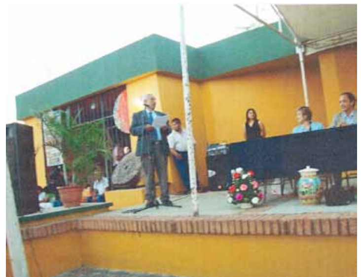
Speakers platform at the 40th Anniversary Celebration of the Observatory in Oaxaca, a joint project with Palo Alto

Now take out your calendars and mark Sunday, October 6th. Most of you know that every two years we hold a "Neighbors Abroad Family Fun Day International Fair" in the Lucie Stern outdoor main courtyard. We not only have games and food, but also the Famous International Store which consists of all donated items from All of You. Start now going through your treasures. When you find items from around the world (not just from our Sister Cities) which you have enjoyed for years, but now would like to donate for others to enjoy, contact me! Since we are all volunteers and all items are donated, the money for everything sold in the store goes directly to the children's projects in Oaxaca, Mexico and Palo, Philippines. It's a win-win situation! You get to clean out, others get new things to enjoy and the children in Oaxaca and Palo benefit.