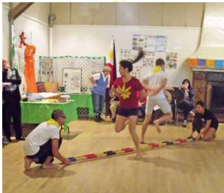
Stanford student dancers entertain with the tinikling dance at the Around the World in Six Cities Celebration.