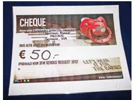
Certificate for Neighbors Abroad's donation to Enschede's fund drive for the U.N.