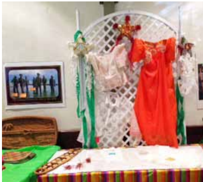
Colorful traditional costumes and artifacts of the Philippines on display in the Palo Booth at the Around the World in Six Cities 50th Anniversary Celebration.