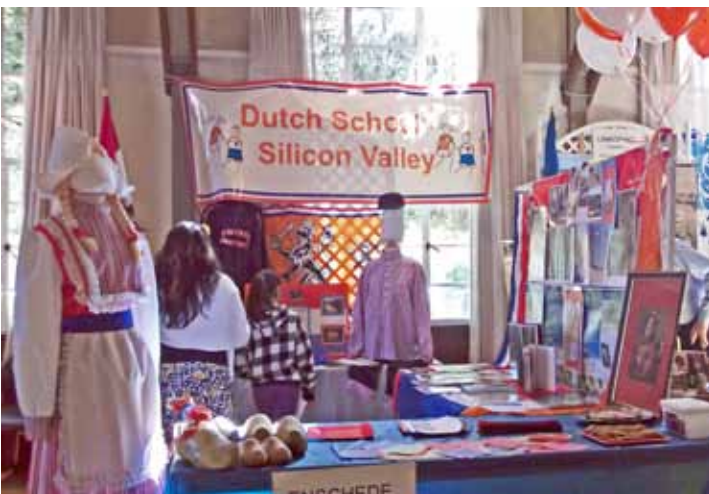
Enschede booth at the Around the World in Six Cities event.