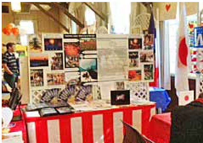
Tsuchiura booth display at the 50th Anniversary celebration.