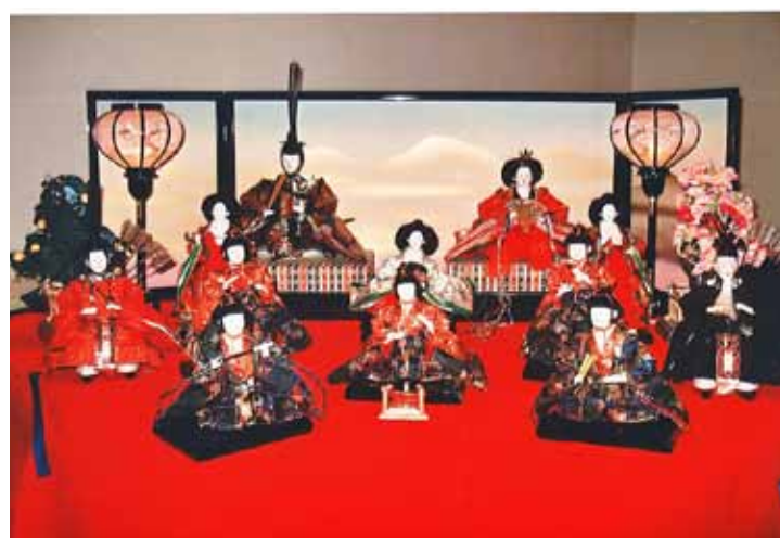
Display of dolls in the Tsuchiura booth.