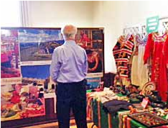
Above, a celebration guest looks at posters and artifacts in the Oaxaca booth.