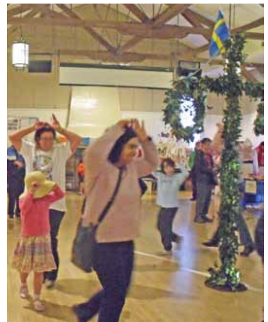
Guests doing the Frog Dance (Små Grodorna) around the Swedish Midsommar Pole