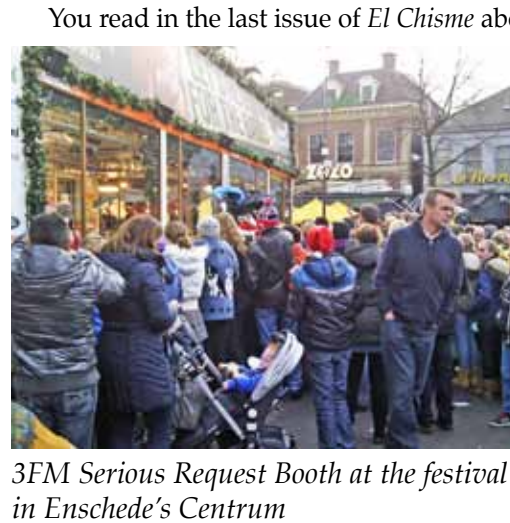
3FM Serious Request Booth at the festival in Enschede's Centrum

Here is the follow-up on news from the Glazen Huis -the special event that ran from December 18-24, 2012 in the Oude Markt in Enschede's Centrum.