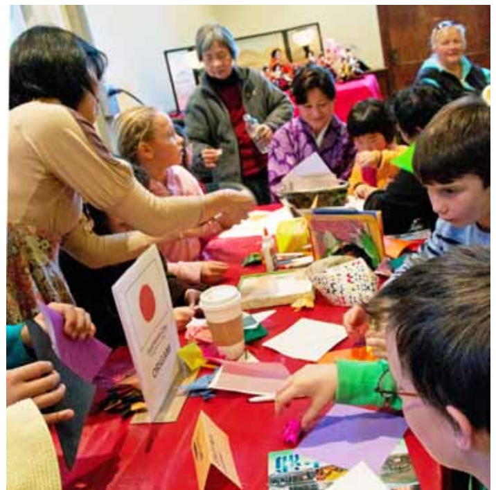
Popular Origami folding table at the 50th Anniversary Festival