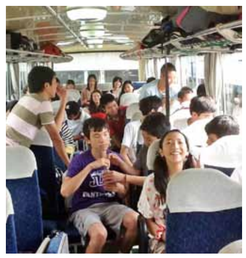
Tsuchiura students join Palo Alto students for a two-day bus tour.

factory followed by zen meditation and a tea ceremony. The evening concluded with a yakisoba barbeque and fireworks as the after dinner treat. Tsuchiura is known for their beautiful fireworks. Everyone spent the night at the Youth Center and we were back on the bus the next morn-