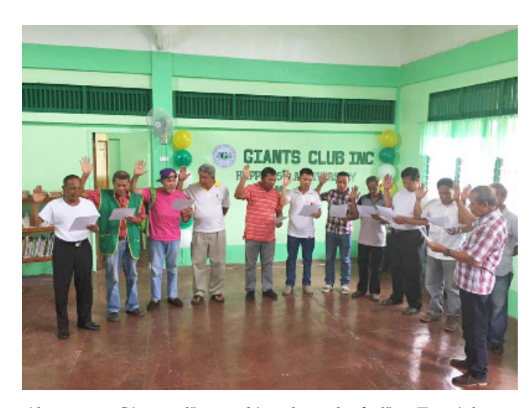
Above, new Giants officers taking the oath of office. Top right, Anniversary sign and decorations. Below right, new officers and spouses pose for an official picture.