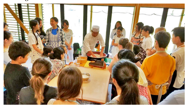
Above: Exchange students watch noodle-making demonstration.