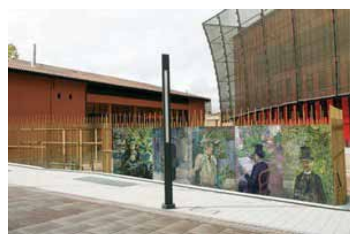
Toulouse Lautrec murals at Albi Civic Center