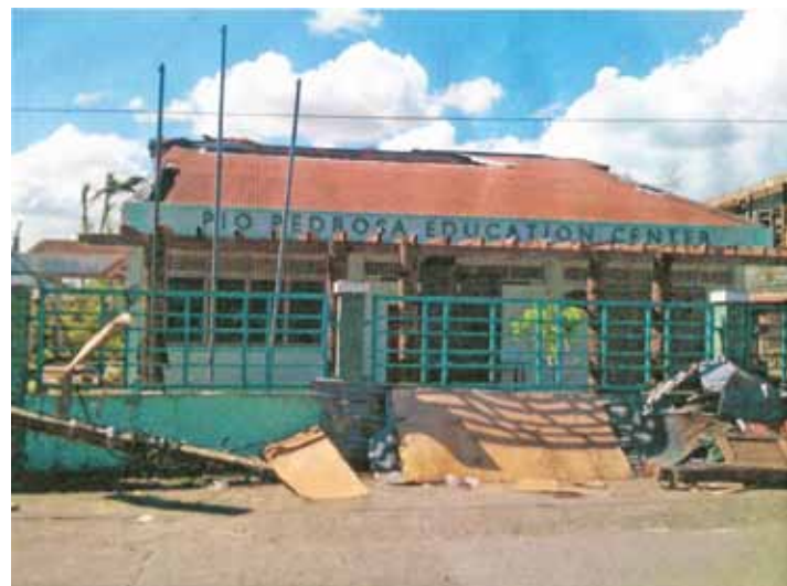
Below: Exterior view of damaged roof