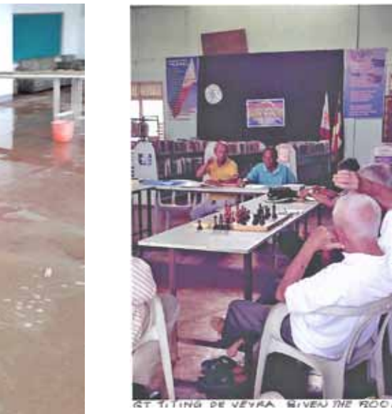
GIANTS meeting: discussion of library damage and repair