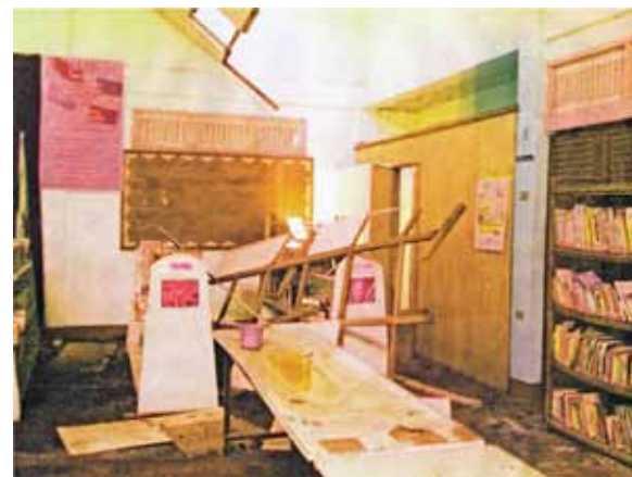
Interior view of roof damage