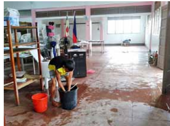
Above and right: Cleaning flooded library