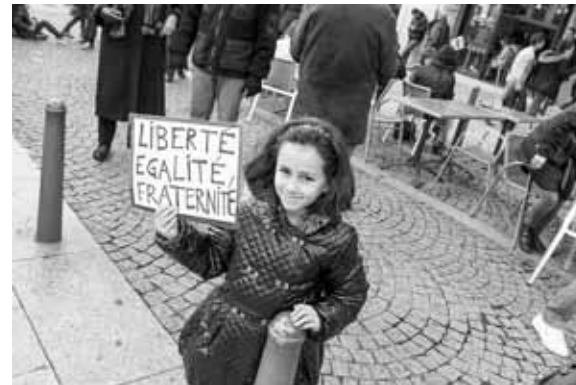
Liberty, Equality, Fraternity!