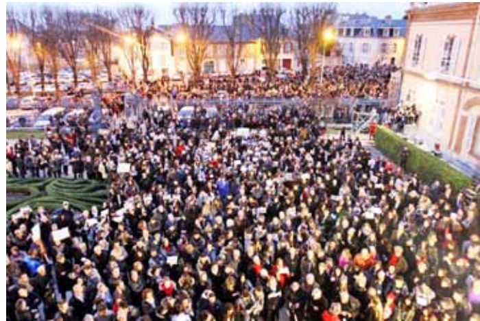
Silent march in Albi