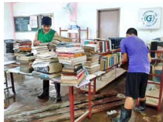
At left: Sorting and salvaging books.