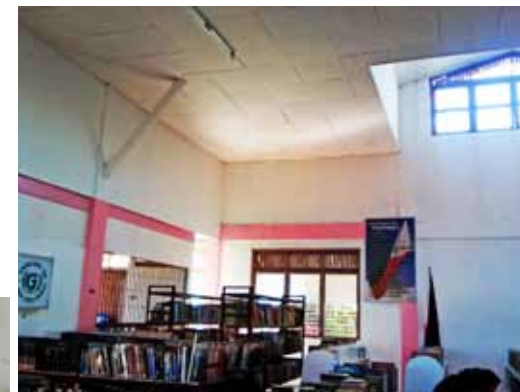
Recent pictures: At right, students studying in the library; above and near left, ceiling intact; far left, kitchen area still under reconstruction