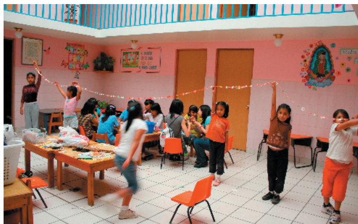
Albergue children hold up a decorative lanyard that they made.

Upon arrival at the orphanage, we were immediately greeted by smiling children that took our hands and led us inside. We were amazed to see how happy all the children were, and it was so heartwarming to see their welcoming smiles. At the orphanage, the goal was to get the children more active through organized activities—including crafts, reading, and sports. We led various crafts such as origami cranes, lanyards, friendship bracelets, and picture frames. Additionally, we read English storybooks to help the children improve their English, played games of soccer and basketball, and taught them how to play American football.