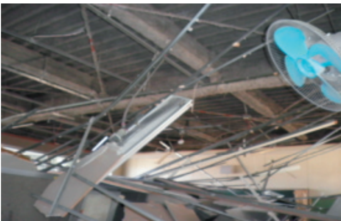
Classroom ceiling 3/11