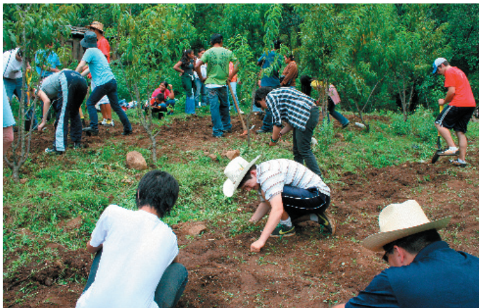
Students busy farming at Pensamiento village.

home-cooked meal using materials paid for by donations from villagers. At both the villages and the Albergue, we were most amazed by the hospitalidad that the Oaxacans showed towards us.