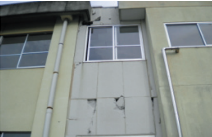
Cracked wall 3/11

After the devastating earthquake in Japan in March, Palo Altans donated to an earthquake relief fund for Tsuchiura organized by the students at Jordan and JLS whose exchange program had to be cancelled. We've heard from Tsuchiura that the funds were used to repair Manabe Elementary School in Tsuchiura. Here are before-and-after photos. See the Tsuchiura article and another photo on page 3