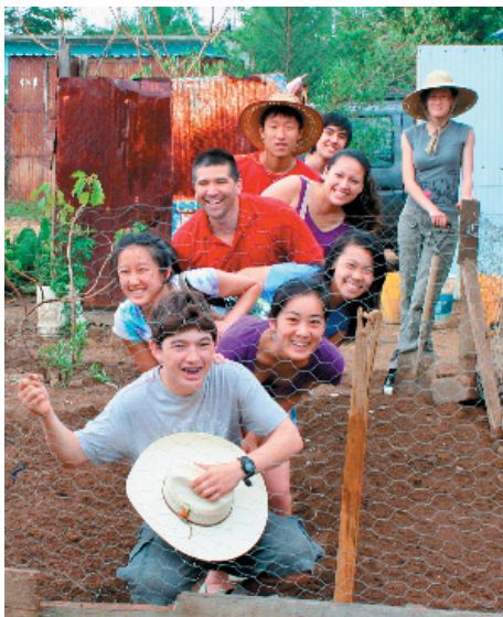
Happy after planting a garden of organic radishes, carrots, and cilantro.