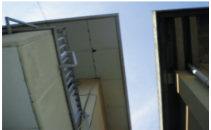
Repairs completed 6/11