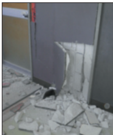
At left: Damaged Hallway Wall 3/11. Below: Repairs complete 7/11

Arigato for your support, Keiko Nakajima