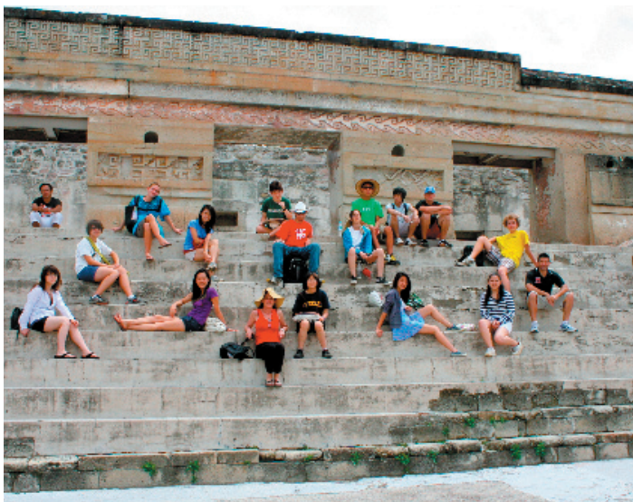
Group Photo of Gunn High School students at Mitla Ruins