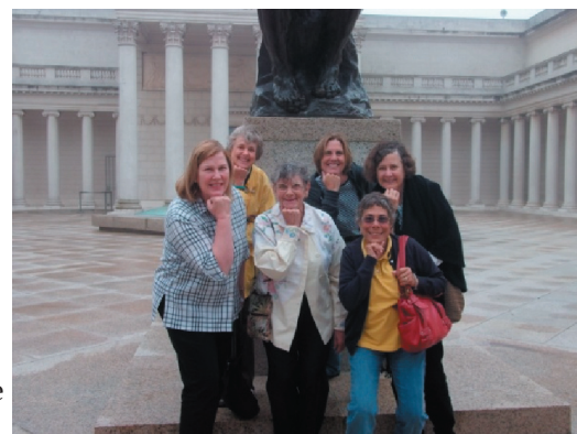
Neighbors Abroad group in the Legion of Honor courtyard