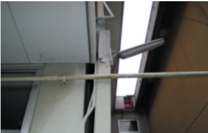
Broken eaves 3/11