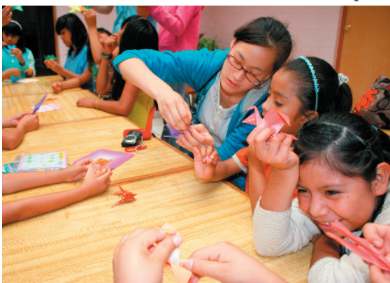
At the orphanage: teaching kids how to fold paper cranes

To help fund the trip, students sent donation request letters to family and friends, contacted local Rotary clubs, and organized churro and pearl milk tea sales at our school. The Kiwanis Club of Palo Alto made a generous donation that went towards our scholarship fund.