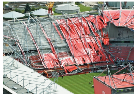
View of stadium damage.