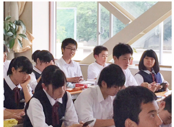
Experiencing a Japanese middle school classroom complete with wearing a uniform.