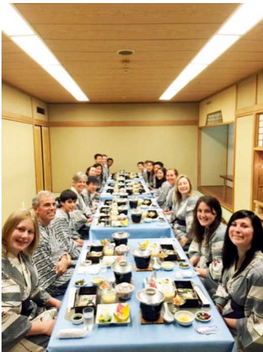
Entire group of Palo Alto visitors wearing Yukata having a traditional Japanese dinner in at their ryokan.(inn).