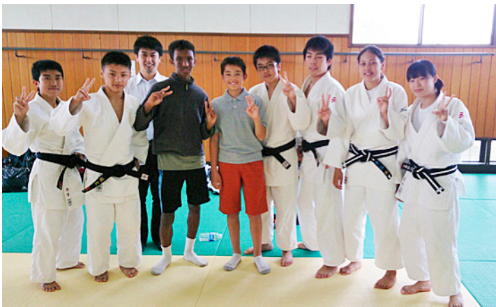
Martial arts lesson with Japanese host students.