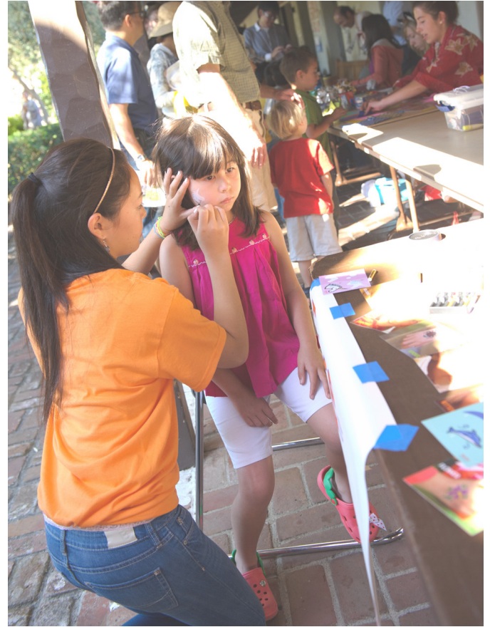
Above, ever-popular face painting at the Japan-Tsuchiura Festival. Below, Tsuchiura Dance Troupe performs in the Community Center courtyard.