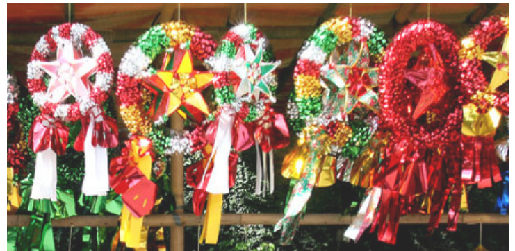
Philippine parols in an open-air shop.