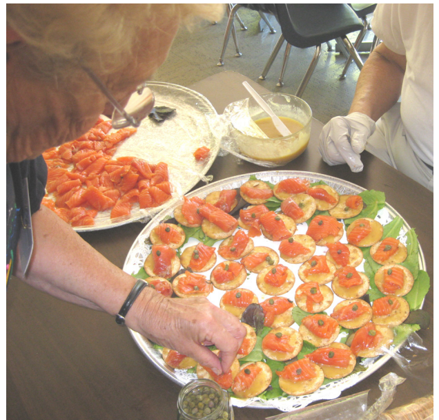
Gravlax hors d'oeuvres being assembled.