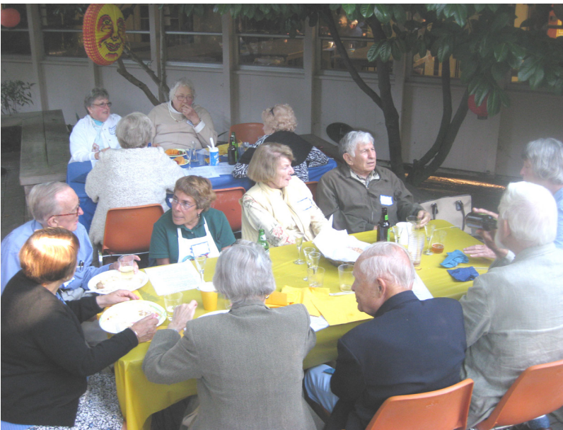
Guests enjoying the pleasant outdoor setting.