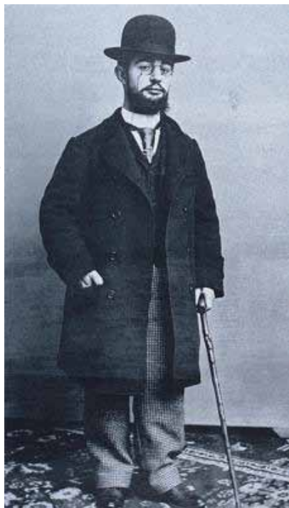
Post-Impressionist Toulouse Lautrec (1864-1901)