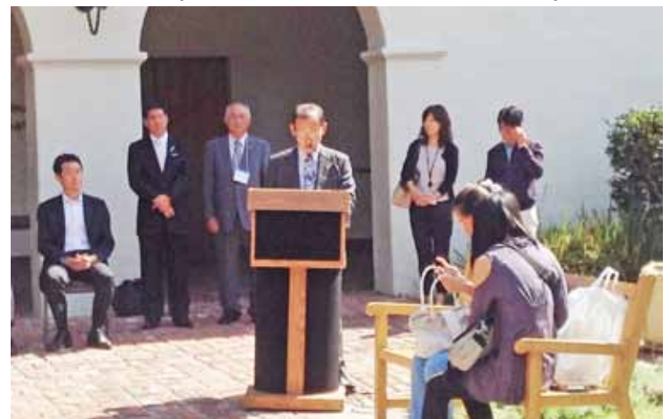
Official ceremony at Japan Festival commemorating Fifth Anniversary of Palo Alto-Tsuchiura Sister-City agreement.