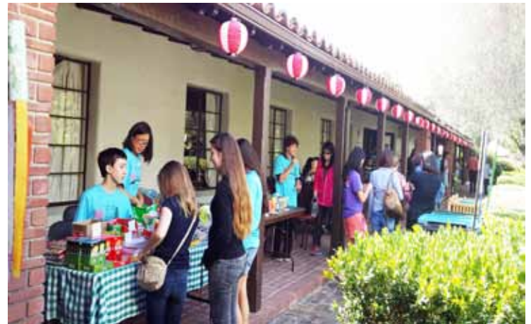
Food and activity tables lined the Lucie Stern Courtyard

See more Japan Festival photos on page 7