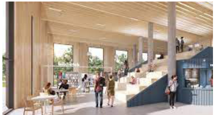
Interior of Agora

Linköping's Artist-in-residence programme is a collaboration between Linköping municipality, the Culture and Sport Administration and its units Konsthallen Passagen, Kulturhuset Agora and Kulturhuset Skylten. Support provided by the Culture and Sport Committee.