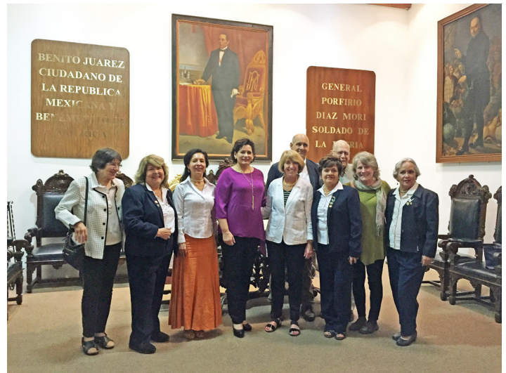
Palo Alto visitors and Oaxaca Committee members in the Oaxaca city council chambers