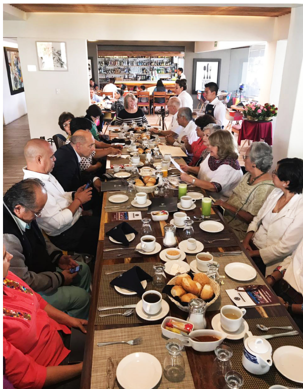
Oaxaca Sister City Committee breakfast for Palo Alto visitors and program heads

Celebration of Twenty-five Years of Loving Care at Albergue Infantil Josefino Orphanage in Oaxaca