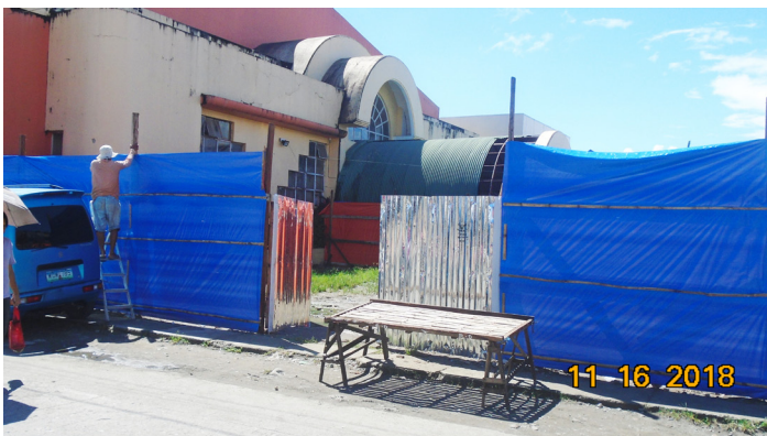
Recent picture received just before press deadline of the preparations to begin construction on the new Children's Library building in Palo.