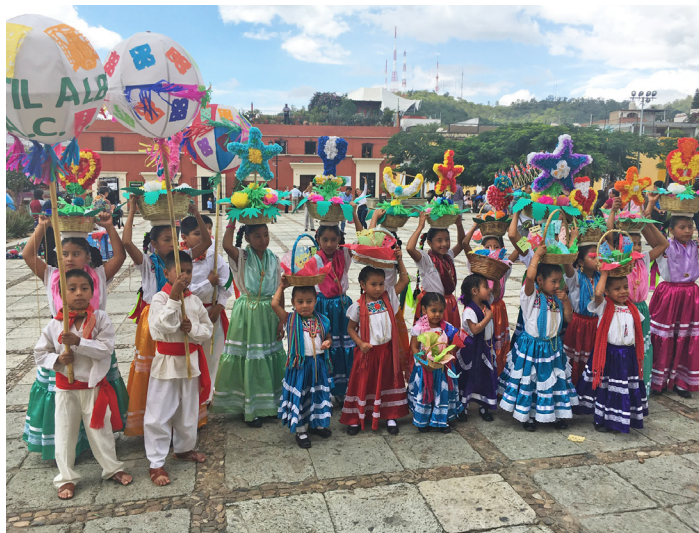
Albergue children on the plaza in front of Santo Domingo after the Anniversary mass.

There is no better way to make peace than the person-to-person relationship. That is how many Oaxacans have fostered peace beyond a geographical space and within the framework of universal values such as solidarity, friendship, tolerance and respect.