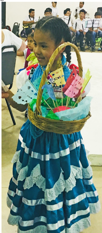
Albergue resident hands out favors at the celebration

Celebration of Twenty-five Years of Loving Care at Albergue Infantil Josefino Orphanage in Oaxaca