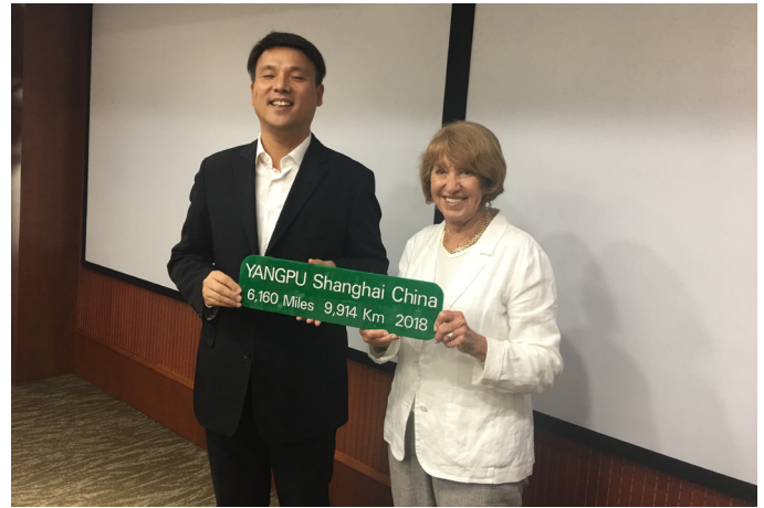
Mayor Xie ZhiGang is charmed by Mayor Liz Kniss's gift of a Yangpu plaque.