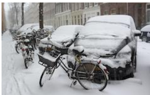
Heavy snow in the Netherlands

Heavy snow covered the Netherlands causing severe alterations in the country's transportation system including disruptions to the rail system and air traffic at Schiphol airport. It was reported 800 km of traffic jams and numerous accidents on Dutch roads.