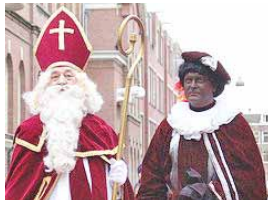
Sinterklaas and Zwarte Piet