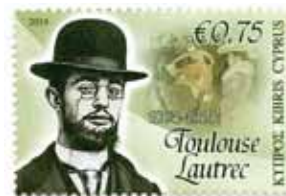
Toulouse Lautrec commemorative stamp issued by Cyprus