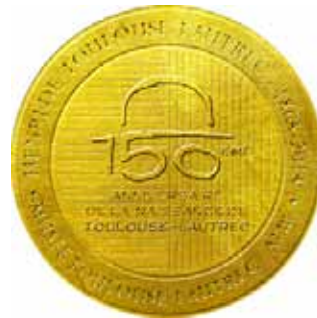
Celebration Coin by Monnaie de Paris