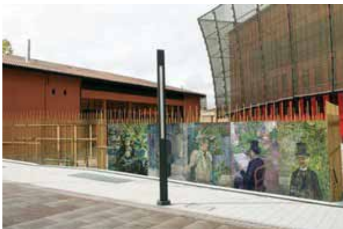
Toulouse Lautrec murals at Albi Civic Center