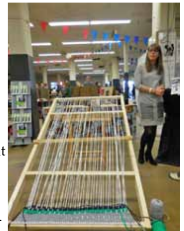
Loom at Maker's Festival

The world of textiles came alive for adults and children as they worked on a 6 foot by 4 foot loom; 3D printers made objects that flew all over the exhibit space; kids "manned" space ships that soared above our heads; visitors designed robots that moved around our feet. I saw adults building musical instruments, and kids riding around in a solar