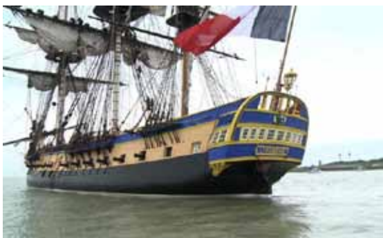
The new L'Hermione

challenging issues was finding the right trees of the right size and curve to become the key parts of the hull. The Royal Oak Forest that was used at the time to build war vessels no longer exists in twenty-first century France!