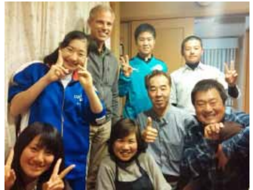
Reunion with exchange family in Tsuchiura