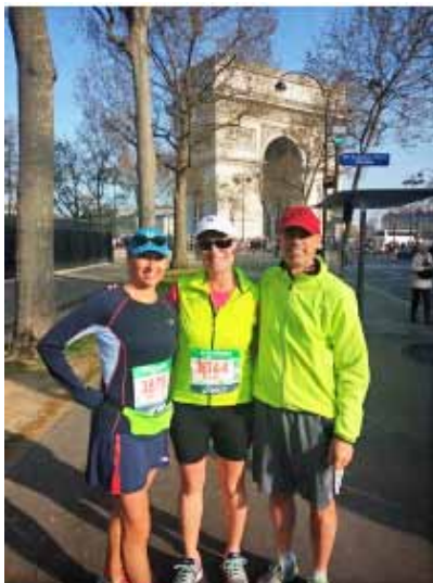
Paris Marathon on April 12

But, the two marathons were scheduled a week apart in April 2015. The Solution: If he were invited to Tsuchiura to compete in the Kasumigaura Marathon, he would not run the whole Paris Marathon, just part of the course.