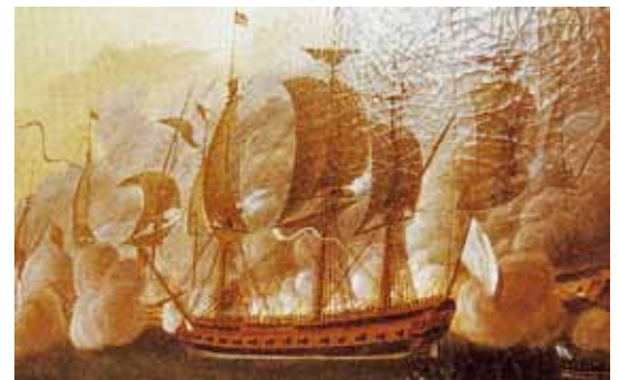
The original L'Hermione

Back in 1780, the Marquis de Lafayette sailed to America on the French Navy frigate L'Hermione on behalf of King of France Louis XVI to participate in the fight for freedom of the Revolutionary War, a famous episode in American history. Two hundred thirty-five years later, she is back! A very moving story began in 1997 in the port of Rochefort in France where a group of enthusiastic amateurs decided to start building a perfect replica of the eighteenth-century vessel and sail to America. With the help of naval experts, they retrieved the original blueprints and started their eighteen-year-long project. One of the most