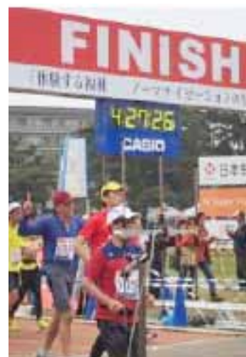
Crossing the finish line and a successful completion of the race.