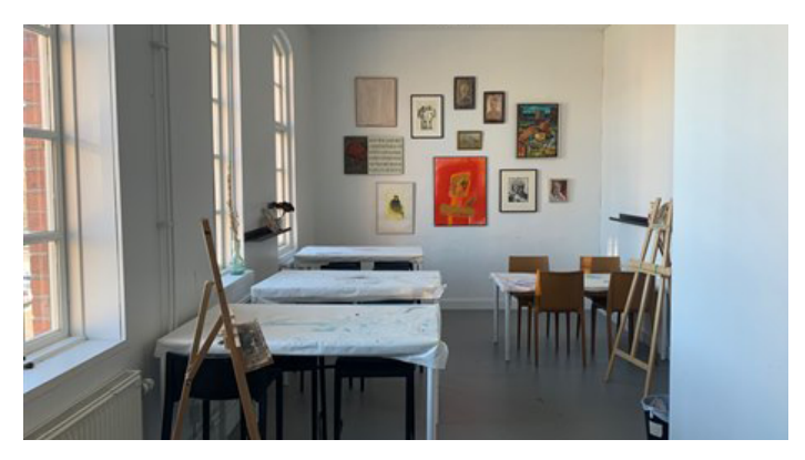
Studio at Skylten